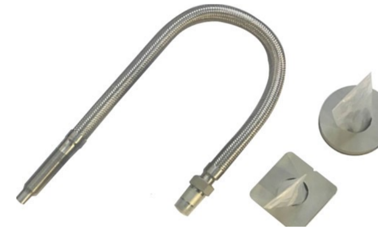
EH-8100 (For Induct System)