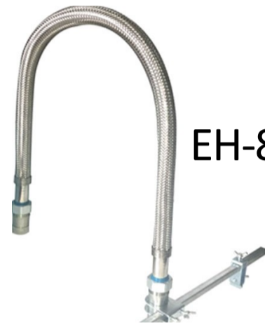
EH-8100-C (For Comercial Ceiling)

Connecting the automatic sprinkler to the pipe, save time and reduce cost.