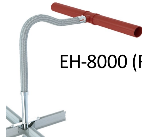
EH-8000 (For Clean Room)